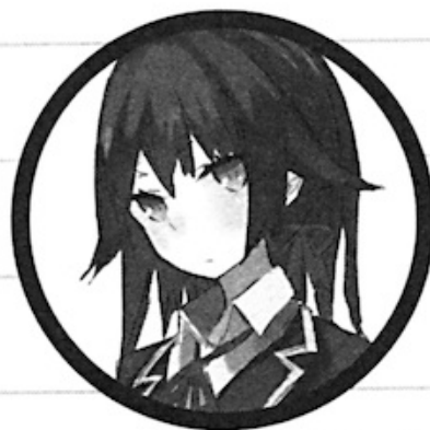
雪ノ下 雪乃 yukino yukinoshita