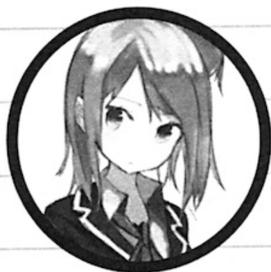
由比ヶ浜結衣 yui yuigahama